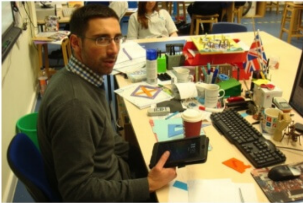
Registration and other administration tasks made easier