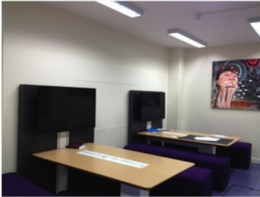
Collaborative working desks with iPad connections and Apple tv in the 6 th form centre, meeting rooms and assembly halls

devices is in flux. The Network Support team investigated wireless access and security options in other settings.